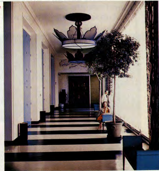
read all about her Draper's life, times and projects (such as The Greenbrier hotel, in White Sulphur Springs, WV, above) are captured in this gorgeous book published in conjunction with a new museum exhibit at the Museum of the City of New York (for more information, go to mcny.org).