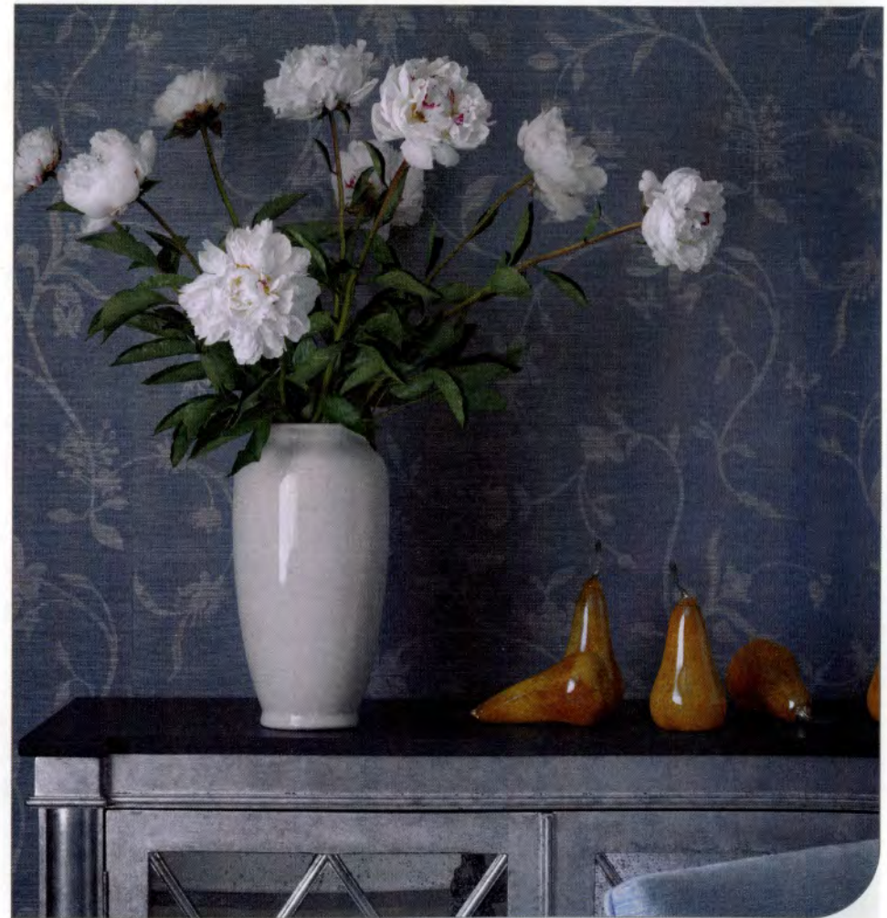
GP & J Baker