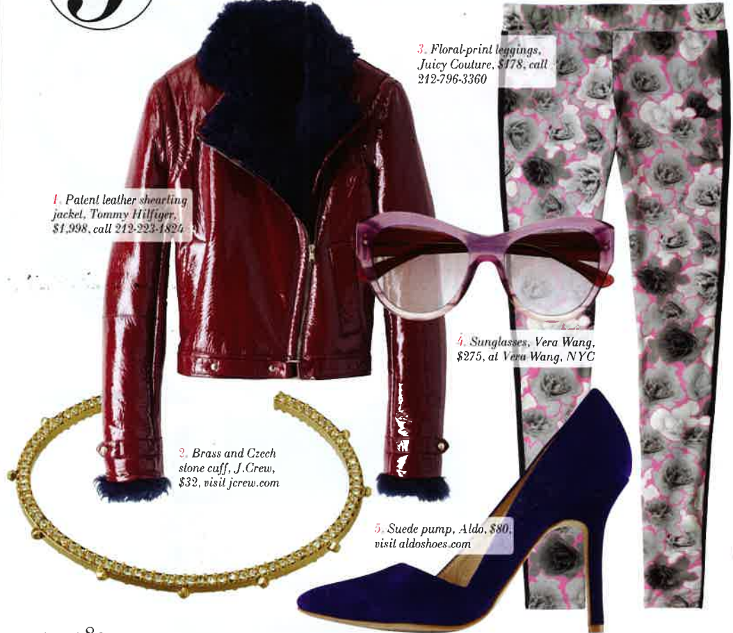
1. Patent leather shearling jacket, Tommy Hilfiger , $1,998, call 212-223-1824