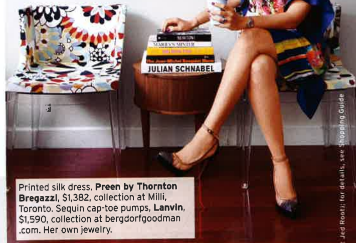
Printed silk dress, Preen by Thornton Bregazzl , $1,382, collection at Milli, Toronto. Sequin cap-toe pumps, Lanvin , $1,590, collection at bergdorfgoodman.com. Her own jewelry.