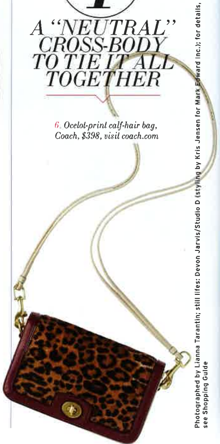
6. Ocelot-print calf-hair bag, Coach , $398, visit coach.com

for details, see Shopping Guide