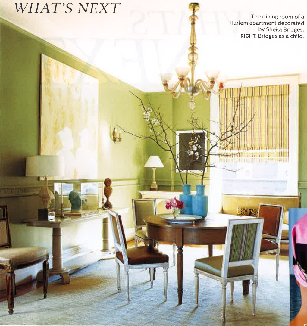
The dining room of a Harlem apartment decorated by Sheila Bridges. RIGHT: Bridges as a child.